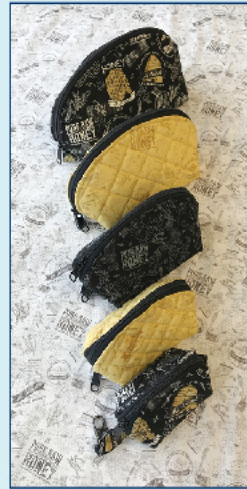
Clam Up Zipper Pouches with Fern Inman – April 12