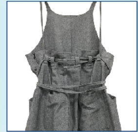
Burnside Bibs with Belinda Batchelder - May 20 & 21