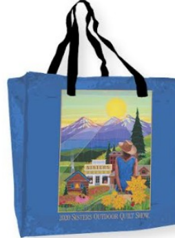
Large Poly Tote $9.95

SOQS Shirts are Sold Out, but there are still Posters and Tote Bags available.